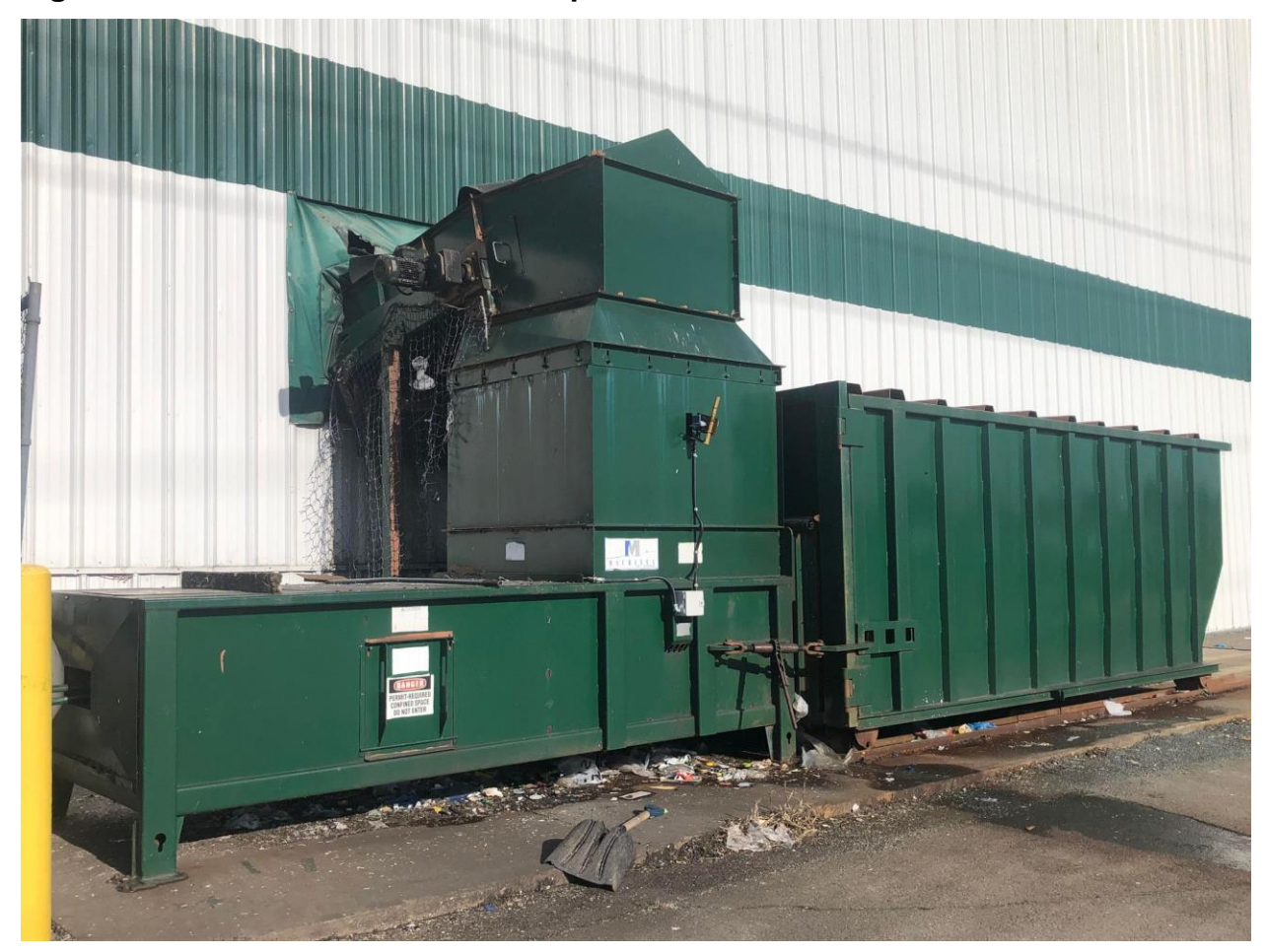
Figure 2 - Refurbished Exterior Compactor and Bin