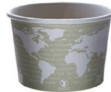
Paper cup & Soup bowl, lined with Ingeo™ biopolymer, a plant-based plastic