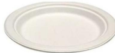
Paper Plate & Paper Napkin