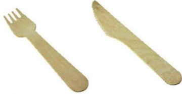
Birch Wood Fork & Knife