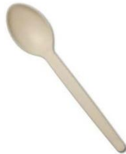
Spoon, made with renewable cornstarch