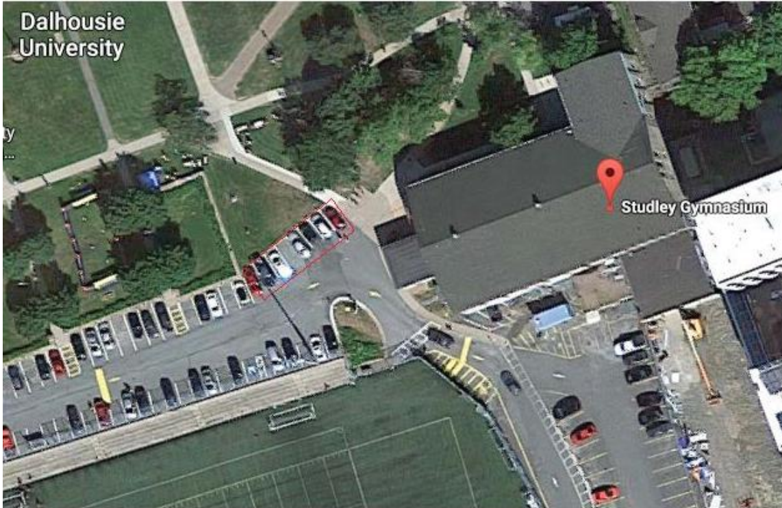
Figure 1. Parking location for Dump and Run vehicles and rented dumpster boxed off in red to the left of the Studley Gymnasium.