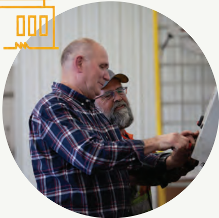
Halifax C & D Recycling/ Municipal Group of Companies staff