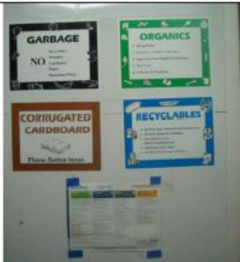
Example of signage that identifies sorting requirements