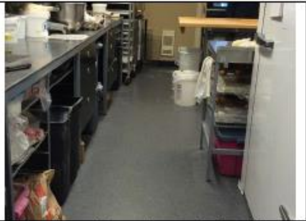
Space for materials storage is at a premium in a kitchen