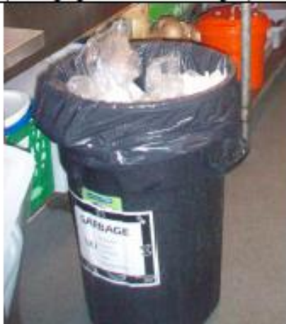
Clearly labelled container filled with soiled plastics that are recyclable if clean and compostable if manufactured to meet standard ASTM 6400