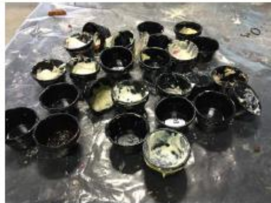
Example of waste reduction opportunity: these disposable ramekins could be replaced by reusable (washable) ramekins