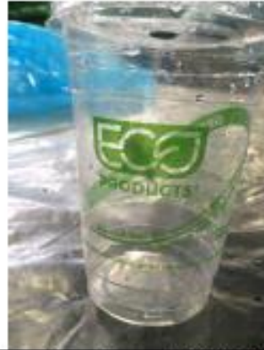
Compostable plastic cup that meets ASTM 6400 standard for compostability and which is BPI-certified