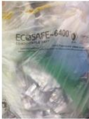
Compostable film plastic that meets standard ASTM 6400