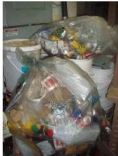
Ad-hoc materials storage as result of lack of planning