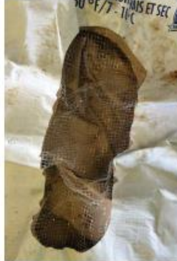
Plastic window on paper vegetable bag limits recyclability and compostability of the paper bag