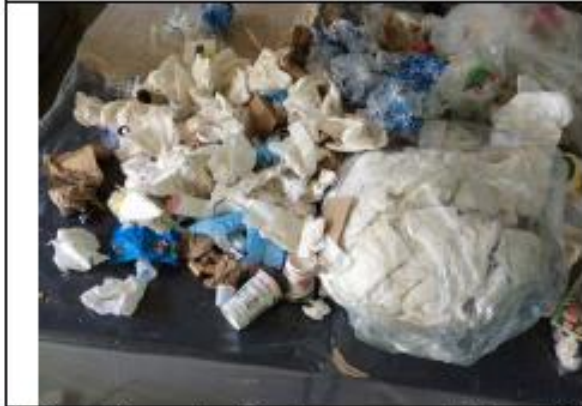
Example of paper towel in washroom managed as "disposable". Patrons can easily use a "compostables" bag if one is supplied in the washroom

All photographs in this Annex were taken either: (i) at restaurants that participated in the audit; or (ii) of materials collected from restaurants that participated in the audit.