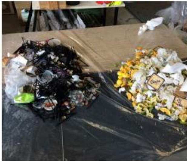
Waste-resources from a bar. Materials on right are compostable, materials on left (mostly straws) must be disposed of. Use ASTM 6400-compliant plastic would allow straws to be composted