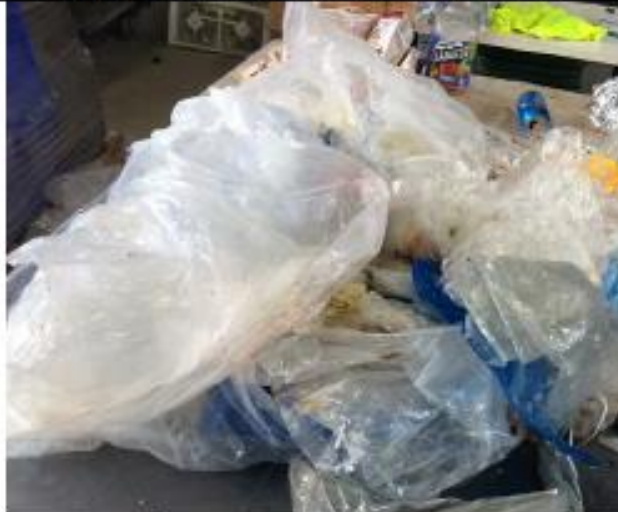
Soiled plastic film that cannot be recycled is generated in large volumes by many restaurants.