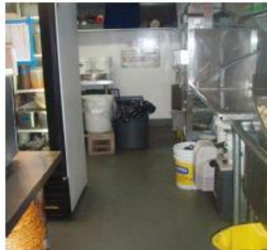
Absence of planning results in ad-hoc placement of waste-resource receptacles and absence of signage