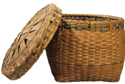
Utility Basket with Cover