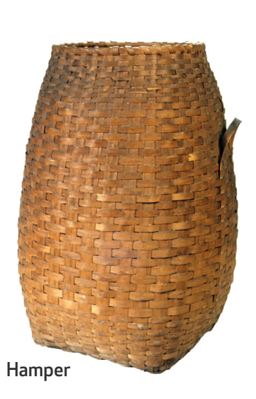
Did you know....

The Mi'kmag also made containers out of other materials —like birchbark. When sewn with skill. a birchbark container could even carry water!