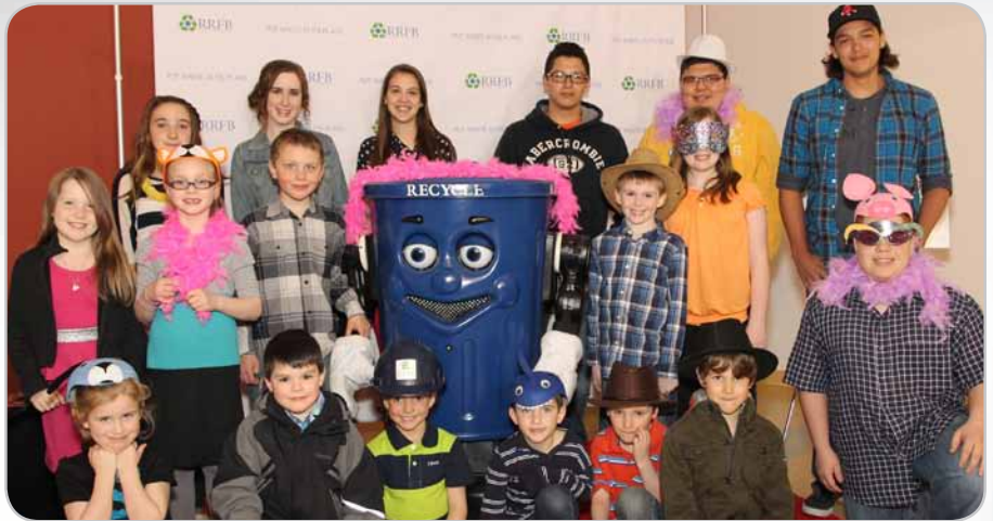
Region 1 Cape Breton winners

Visit www.putwasteinitsplace.ca for contest details and the full list of 2013–2014 winners.