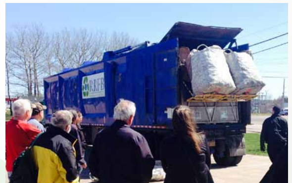
Demonstrating the compaction trailer to ENVIRO-DEPOT™ owners/operators in Cape Breton

RRFB Nova Scotia has purchased three new compaction trailers and in September 2014 will begin collection at the majority of Enviro-Depots along main highway routes throughout the province.