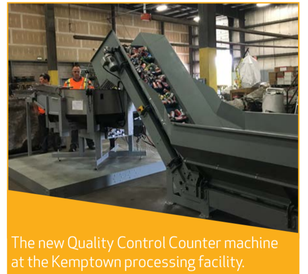
The new Quality Control Counter machine at the Kemptown processing facility.