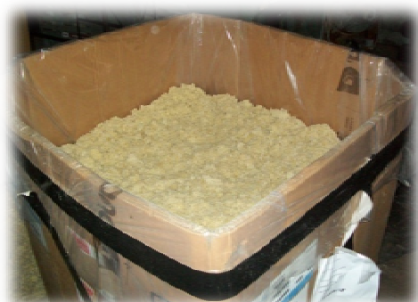
Figure 11: Shredded Polyurethane