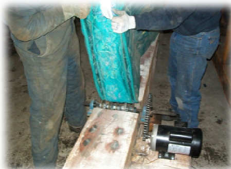
Figure 7: Mattress passing through HCD machine