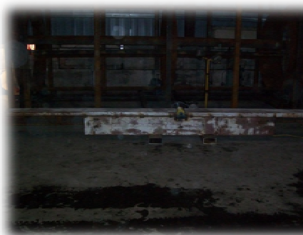
Figure 8: HCD mattress machine