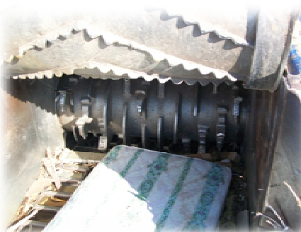
Figure 6: Horizontal grinder