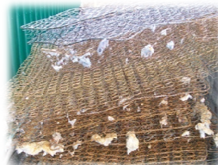
Figure 12: Dismantled mattress coils