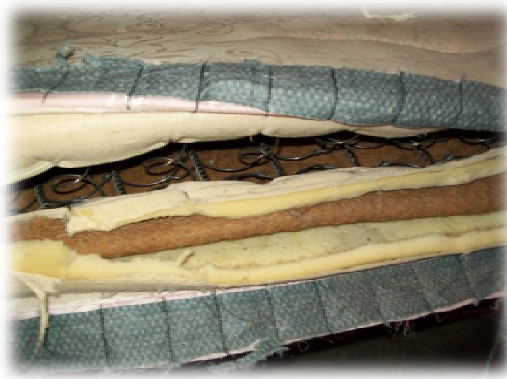
Typical mattress components

The components found in discarded mattresses and box springs are shown in the table below as well as the percentage of the components compared to the total weight of the mattress or box spring. Data collected from our sample batch outlined in Table 1,