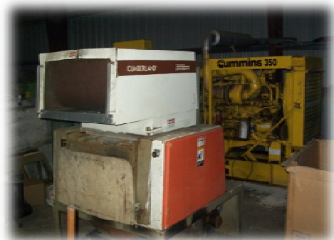
Figure 9: Component Shredder