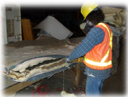
Figure 4: Dismantling w/grinder