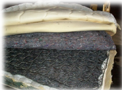
Figure 2: Mattress components