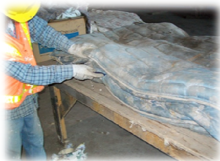
Figure 3: Hand dismantling w/knife