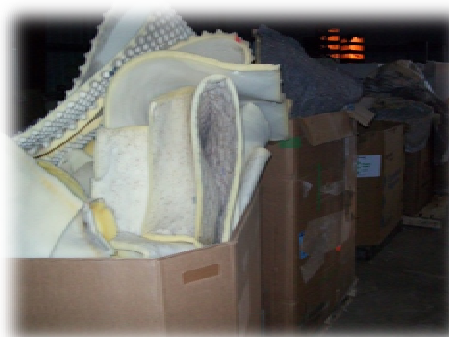
Figure 10: Gaylord boxes of pre-shredded components