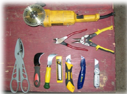
Figure 5: Hand tools used for dismantling