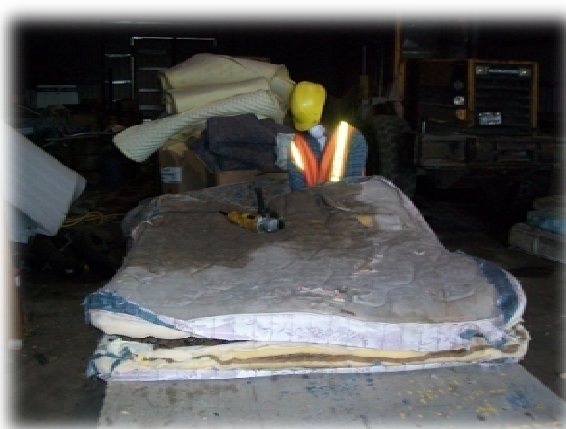
Figure: Hand dismantling a mattress

The second method of hand dismantling used involved a disc grinder to cut the side walls and hog ties rather than having it done hand shears. This method significantly sped up the processing time. The major issue with this method was it created a fire