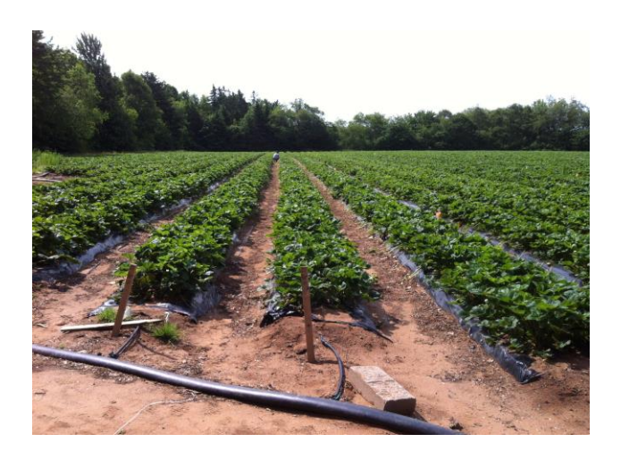
Figure 1: Strawberry plots in Mid June 2012.

The experiment took place at Dykeview strawberry farms in Kingston, Nova Scotia, in the summer of 2012. Last year's plots from the experimental design were still intact for the second year of that project except for superimposing of compost tea treatment (figure 1). The layout was a strip-strip plot design with three factors and three replications. Treatments consisted of three rates of MSFW compost from year one (2011) of (0, 5, 10, and 20 Mg ha<sup>-1</sup> fresh weight basis), three rates of fertigation (25%, 75%, and 100% of recommended rate; due to compromised data last year the 50% fertigation rate unfortunately had to be excluded from the project) which consist of potassium nitrate, calcium nitrate, and magnesium sulphate. Compost tea was applied monthly at random rates of 0, 60 L ha<sup>-1</sup> and 120 L ha<sup>-1</sup>, through drip irrigation (Figure 2). The recommended rates of fertigation last year (2011) were developed based on soil test results and crop nutrient requirement. Subplots dimensions are 4.0 m x 4.8 m. Each plot consists of three flat hills (75cm wide x 10cm high), and there were two strawberry rows 30 cm apart on each hill. Three strawberry plants from each side of the data row and each subplot data row consist of 20 strawberry plants.