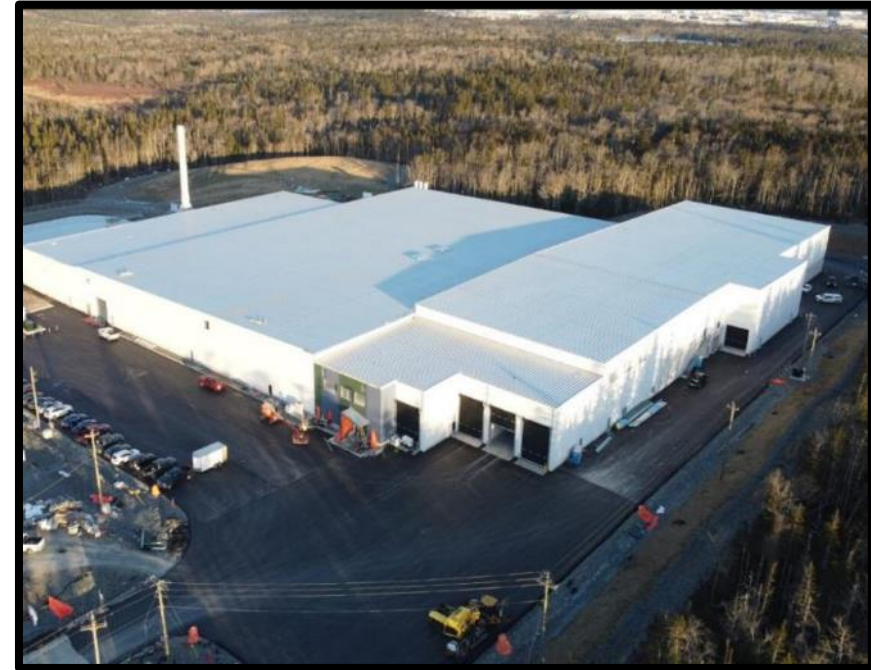
New Ragged Lake Organics Facility