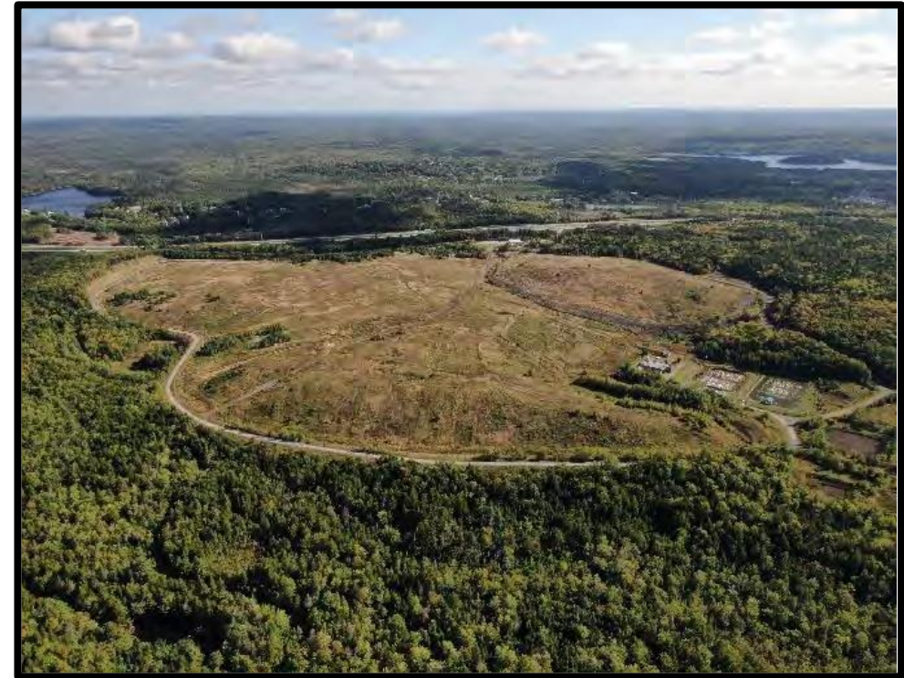
Highway 101 Landfill

Approximately 44,000 CO 2 e/year could be avoided to support the 2030 HalifACT goals